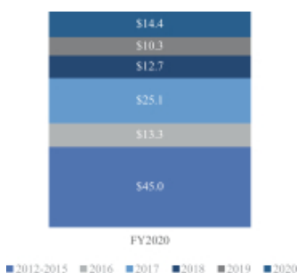
2020 Total Revenue by Customer Cohort

In addition, as shown in graph below, we have many customers who have been customers for multiple years, as evidenced by 69% of our revenue for the year ended December 31, 2020, being from customers who have generated revenue with us since 2017 or earlier. This is calculated by analyzing our 2020 revenue and grouping customers according to the year in which such customers commenced generating spend with us.